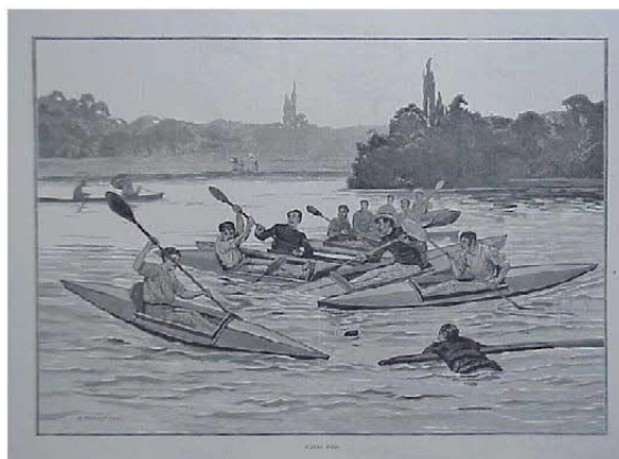
Water Polo. The Illustrated London News, 1 September 1883. Artist, E Morant Cox.

The move to a baths setting and the creation of the BAT together provided the impetus to reshape the sport: the pool limiting the size of the playing area and the smaller boat leading to a more maneuverable craft. There were few rules of play, but these would change too.