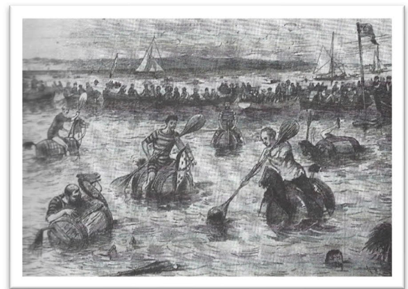
Water polo at Hunter's Quay, Scotland , The Graphic , 18 September 1880. Artist, W Ralston