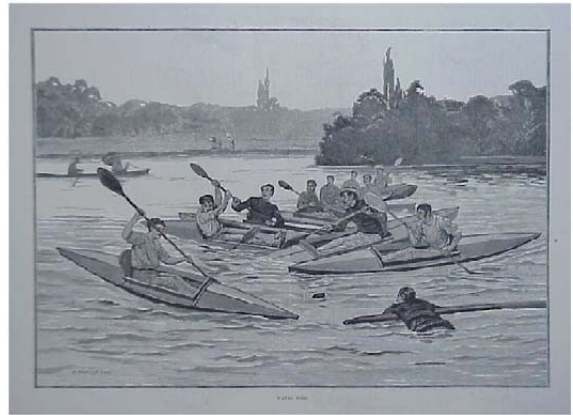
Water Polo. The Graphic, 1884.

An international competition beckoned. An enthusiastic following had grown through the schools in England and canoe polo played in swimming baths was an emerging national sport. It was introduced as a demonstration sport at the Crystal Palace Exhibition , London in 1970 and caught the imagination. Such was the interest that the first English National Championships were held at the National Canoe Exhibition in the following year. Subsequently, the championships were