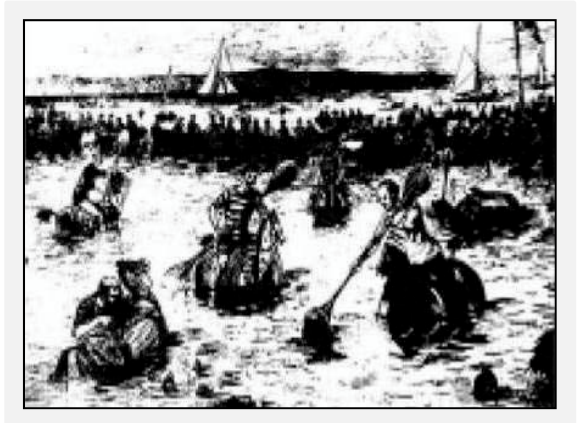
Water polo at Hunter's Quay, Scotland , The Graphic , 1880.