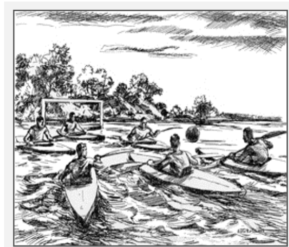
Canoe polo in the 1929 final, artist: Artur Nikolaus